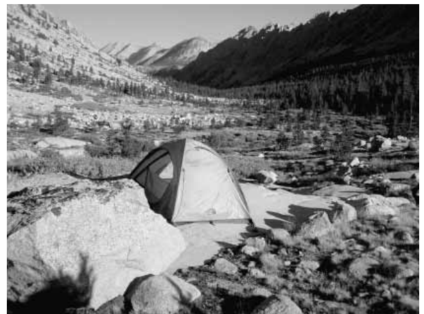
Figure 3—Upper Bubbs Creek watershed, Kings Canyon National Park.