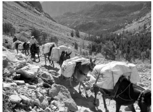
Figure 4—Pack train, John Muir Wilderness.

human presence and occurrence of Giardia cysts in streams in the Sierra Nevada, California. J. Freshwater Ecol. 4(1): 71-75.