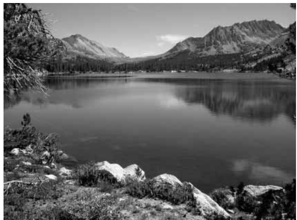
Figure 2—Bench Lake, Kings Canyon National Park.

The results of this study were similar to a smaller study performed in 2004 that examined 60 lakes or streams sites in the Sierra backcountry (Derlet and Carlson 2006). In that 2004 study, 100% of water collected below Cattle Grazing watersheds grew coliforms and 80% of Pack Animal sites had coliforms found. In addition, 7% of Backpacker sites and 7% of Wild sites yielded coliforms, similar to the current study. Day Hiker sites were not included in that analysis, but based on the current study, have the same risk profile as Wild and Backpacker sites. It is not possible to find sites exclusively used by pack animals, as these sites were also used by backpackers (see figure 3), therefore some of the coliforms found at these sites could have originated from human waste. Against this possibility, Backpack sites had no more coliforms than Wild sites. The Wild sites essentially served as control sites that measured background coliform levels.